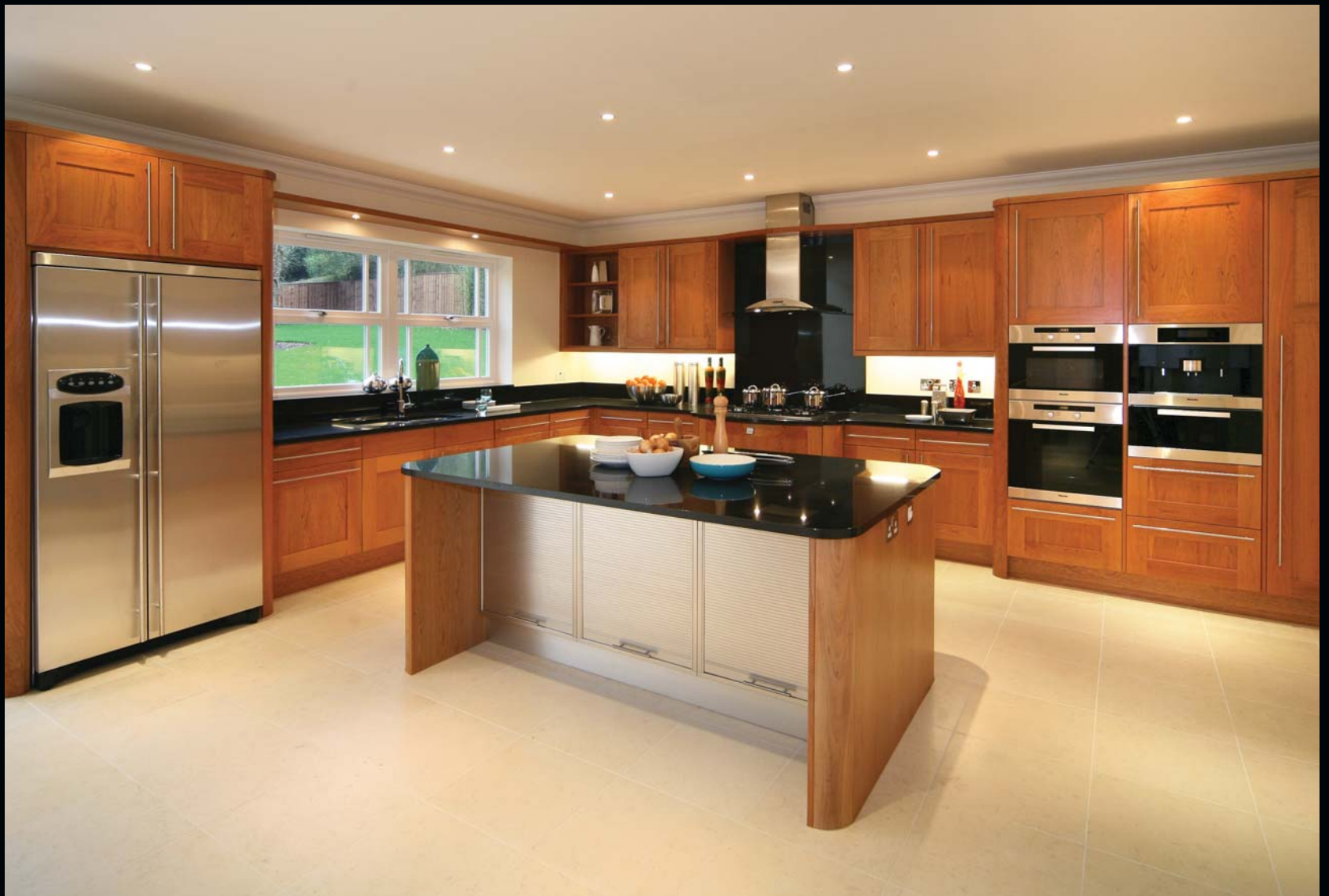
Interior photography taken from previous Wentworth Homes developments